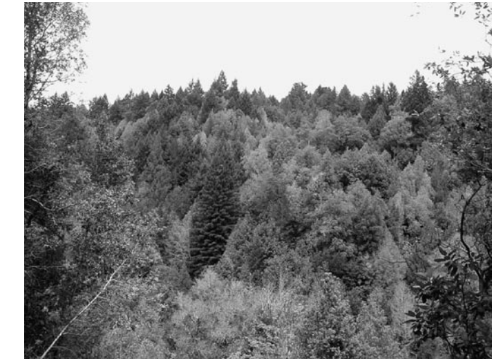
Sudden Oak Death in southern Humboldt County.

Although it was discovered in European nurseries in the mid 1990's, it wasn't recovered from plants in California nurseries until 2001. By 2003, the pathogen was detected in California, Oregon, Washington, and British Columbia nurseries.