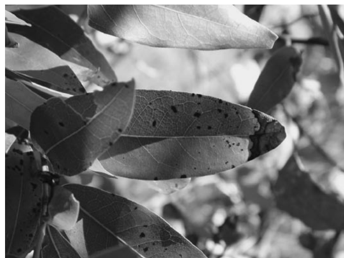
Typical leaf spot symptoms on California bay laurel

According to COMTF, possible ecological threats include a change in species composition in infested forests and therefore, in ecosystem functioning; loss of food sources for wildlife; a change in fire frequency or intensity; and decreased water quality due to an increase in exposed soil surfaces.