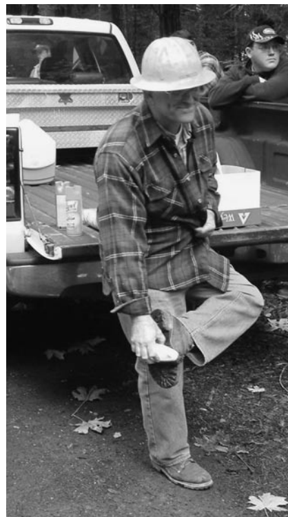
Brush off boots and spray with a disinfectant.

Potentially infected material that consists of small branches or has been chipped can be delivered to a local green power plant that is within your restricted county. There are cogeneration power plants in Fairhaven and Scotia in Humboldt County. Other green-waste fired cogeneration power plants are being planned in other counties.