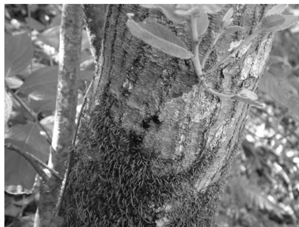
Weeping sap on a young tanoak tree. Diseased tissue top, healthy bottom.

feet of the ground. Underneath the bleeding is a canker with dark patches of infected tissue surrounded by healthy tissue. Once leaves begin to turn yellow and brown, the entire tree may die within a few months (thus is sudden oak death). In other hosts, the primary symptoms are leaf spot and twig die-back. Laboratory culture of P. ramorum is needed to confirm the diagnosis of SOD. For diagnostic assistance, please contact your local County Agricultural Commissioner or University of California Cooperative Extension (UCCE).